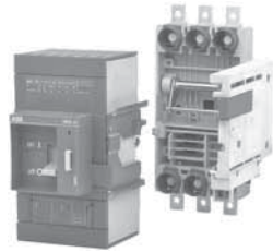
Rear plug-in & drawout circuit breakers